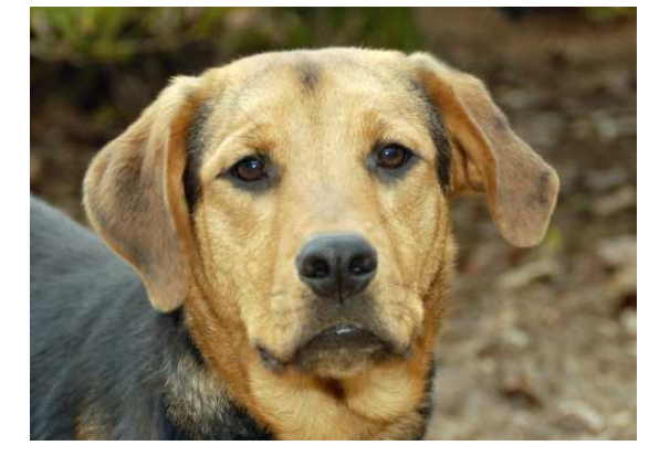
Clyde 3 years old 100 pounds of love and sweetness. Loves kids.

Bud / Ernie 5 years old 40 pounds House broken crate trained mother was a pure golden.